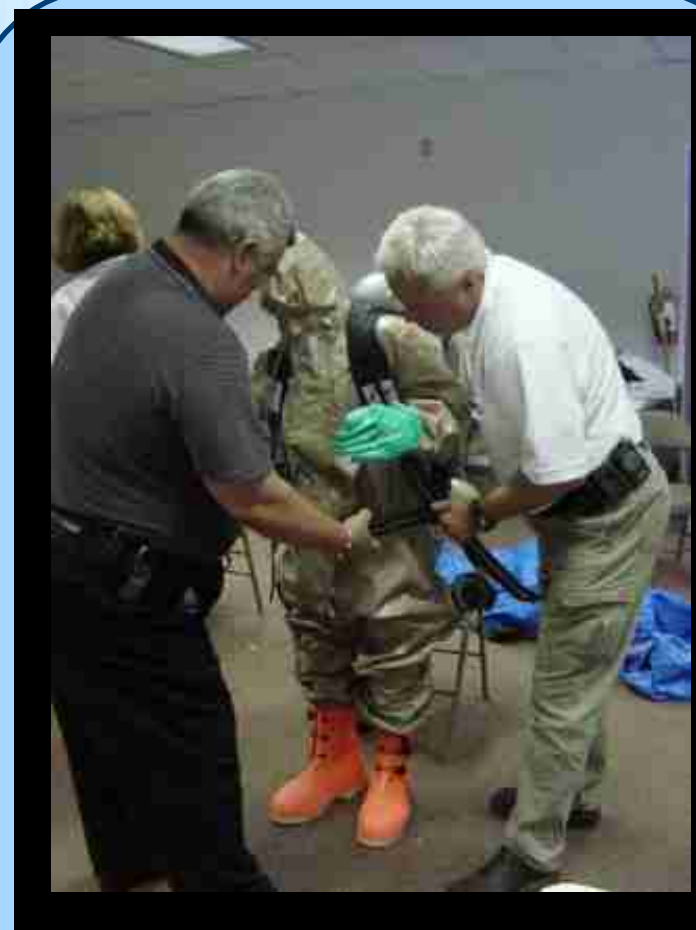
Attending a conference on HazMat Procedures